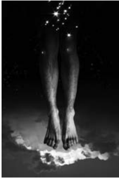
Nick Clifford Simko (MICA) / To become the many gems of heaven: rise / 2010