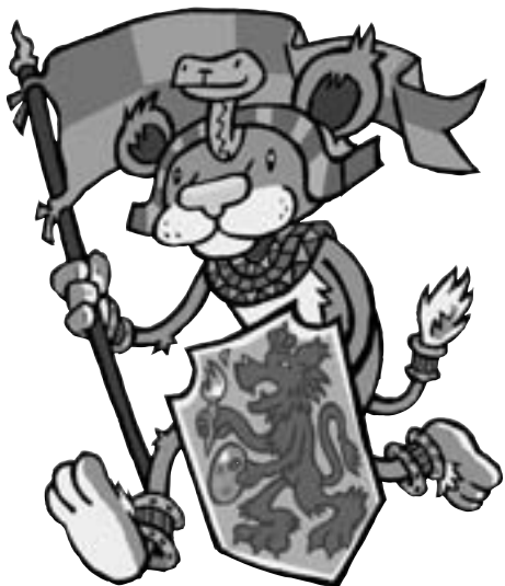
Waltee Illustration by Brian Ralph

Explore a medieval kingdom, meet colorful characters and create dazzling artwork. Marvel at performers and feats of medieval might. Dress up as a medieval lord or lady and take your place in the court.