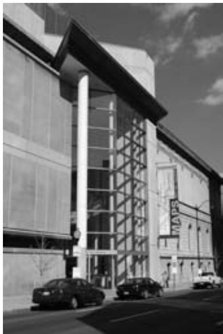
The Walters Art Museum

Close your eyes and imagine a dimly lit tomb and the eerie silence of an ancient burial chamber. Travel back in time with this workshop where students will discover ancient Egyptian gods and goddesses, pharaohs, hieroglyphs and mummies.