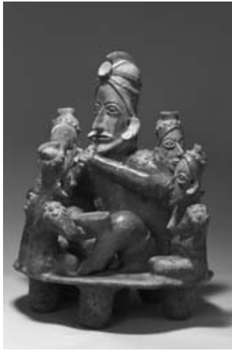
Anonymous (Mexican) / Feasting Scene / 300 BC-AD 300