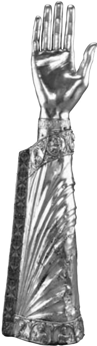
Arm Reliquary of the Apostles / Romanesque (German, Lower Saxon, Hildesheim?) / c. 1195 / The Cleveland Museum of Art, gift of the John Huntington Art and Polytechnic Trust / 1930.739