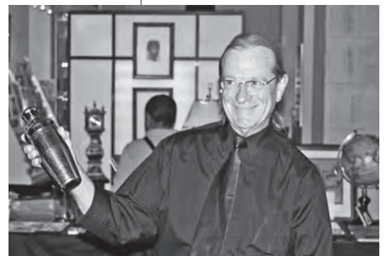
First Fridays at the Walters

Join us for entertainment, music and cocktails as we celebrate the arts of the famous Silk Road. First Fridays is the "it" place to mix, mingle and enjoy art, culture and new friends.