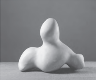
Jean Arp, The Woman of Delos (La dame de Delos) , conceived in 1959; lifetime example; courtesy Adler & Conkright Fine Art