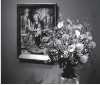
Art Blooms at the Walters