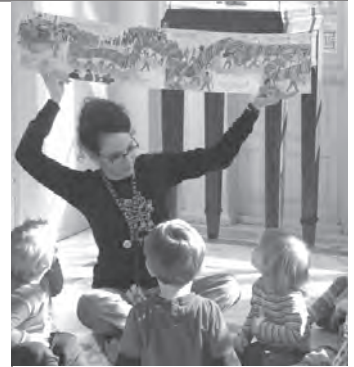
Arttots program at the Walters

HOTEL INFO Peabody Court is the official hotel of the Walters Art Museum. This historic property is just around the corner from the museum and features George's, a full-service restaurant. For hotel reservations, call 1-800-292-5500 and ask for the special Walters discounted rate.