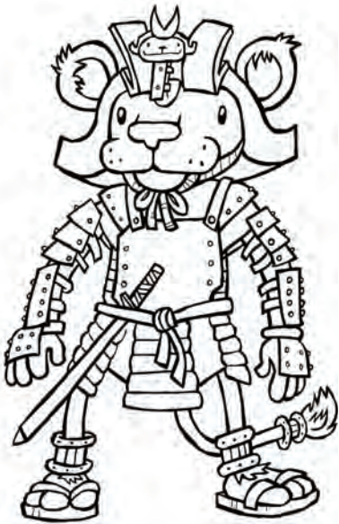
Waltee illustration by Brian Ralph