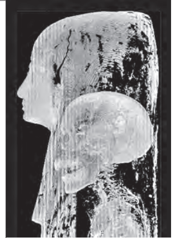
CT scan of mummy