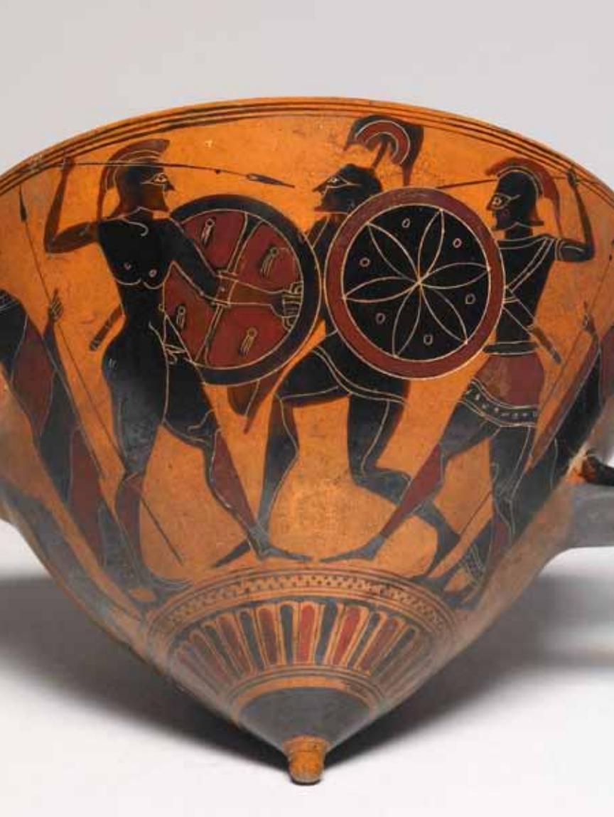
Dueling Warriors (detail), Attic black-figure mastos, ca. 530 BCE