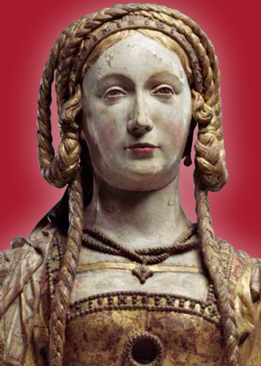
Reliquary Bust of St. Balbina / South Netherlandish (Brussels?) / ca. 1520-30