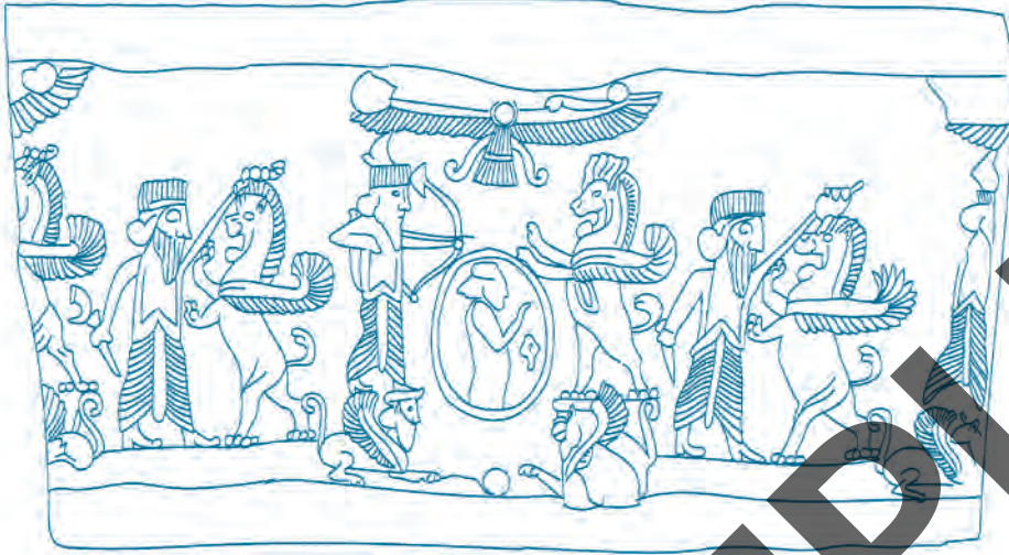
Cylinder Seal with a Combat Scene , Iran, ca. 521–330 BCE. The Walters Art Museum, Baltimore. Illustration by Sydney Lee.