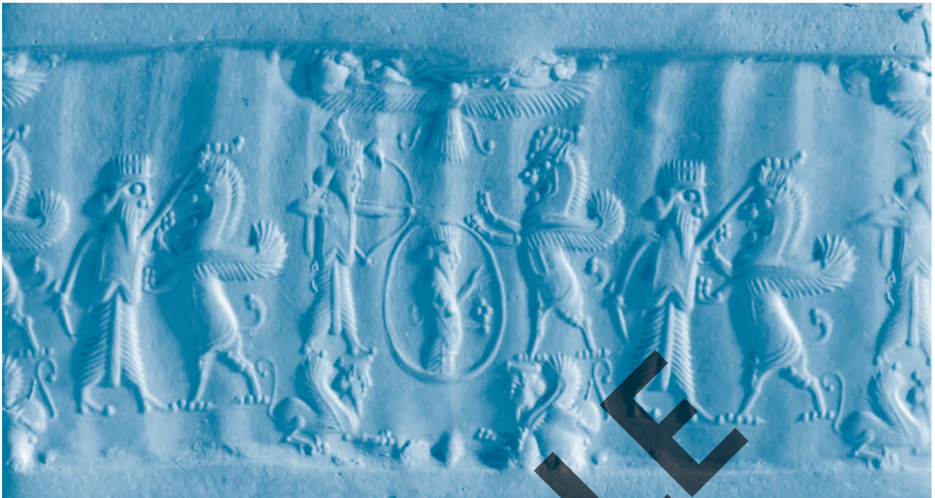
Cylinder Seal with a Combat Scene , Iran, ca. 521–330 BCE (Achaemenid), chalcedony, acc. no. 42.775. The Walters Art Museum, Baltimore.