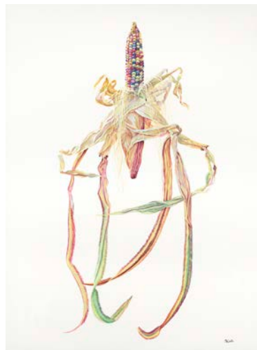
2. Cintli, Corn, Maíz

Museum purchase with funds provided by the W. Alton Jones Foundation Acquisition Fund, 2023