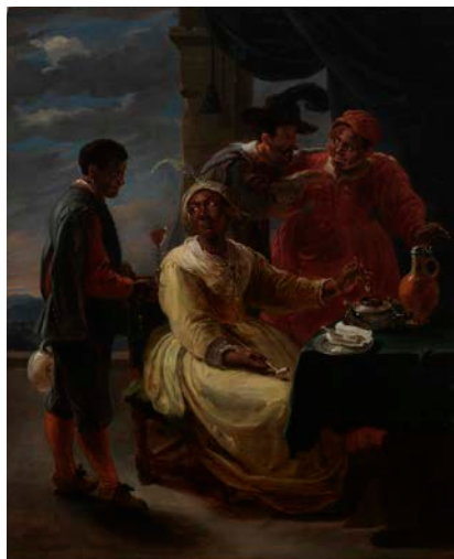
1. Tavern Owner on a Veranda with Two of Her Staff and a Client